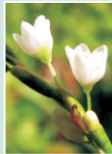
Flowers © ALAIN BELLIEU