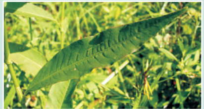
Lance-shaped leaves © MEGAN CROWLEY