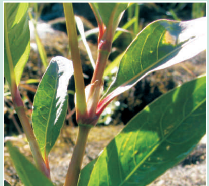
Robust stem and ocrea around the branching points